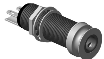
Jack tip flush with strap-ring